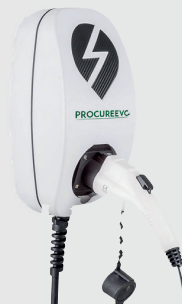
EVCStandard Charging Station