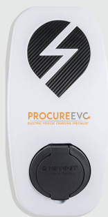
EVCIQ Charging Station